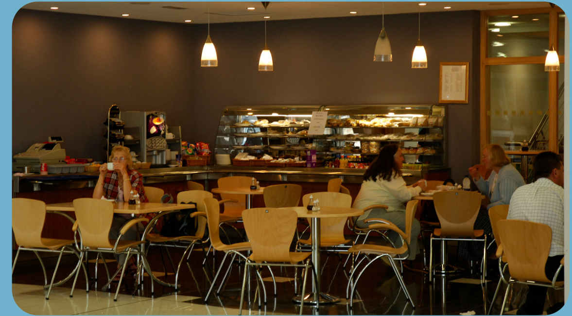
One Stop Coffee Shop

Go to the concierge (located directly opposite the Multi Storey entrance) and sign in, the interviewer will be notified of your arrival.