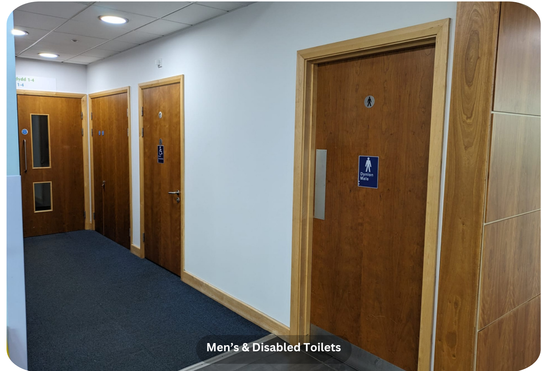
Men's & Disabled Toilets