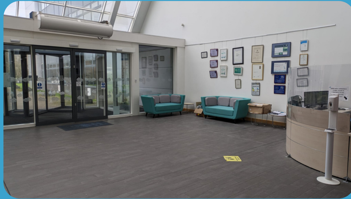
Reception & Waiting Area

There's an automatic rotating door at the entrance with disabled access to the right.