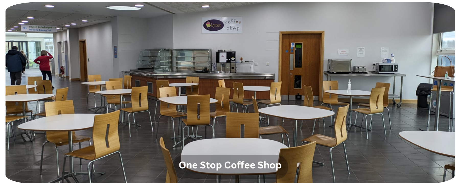
One Stop Coffee Shop