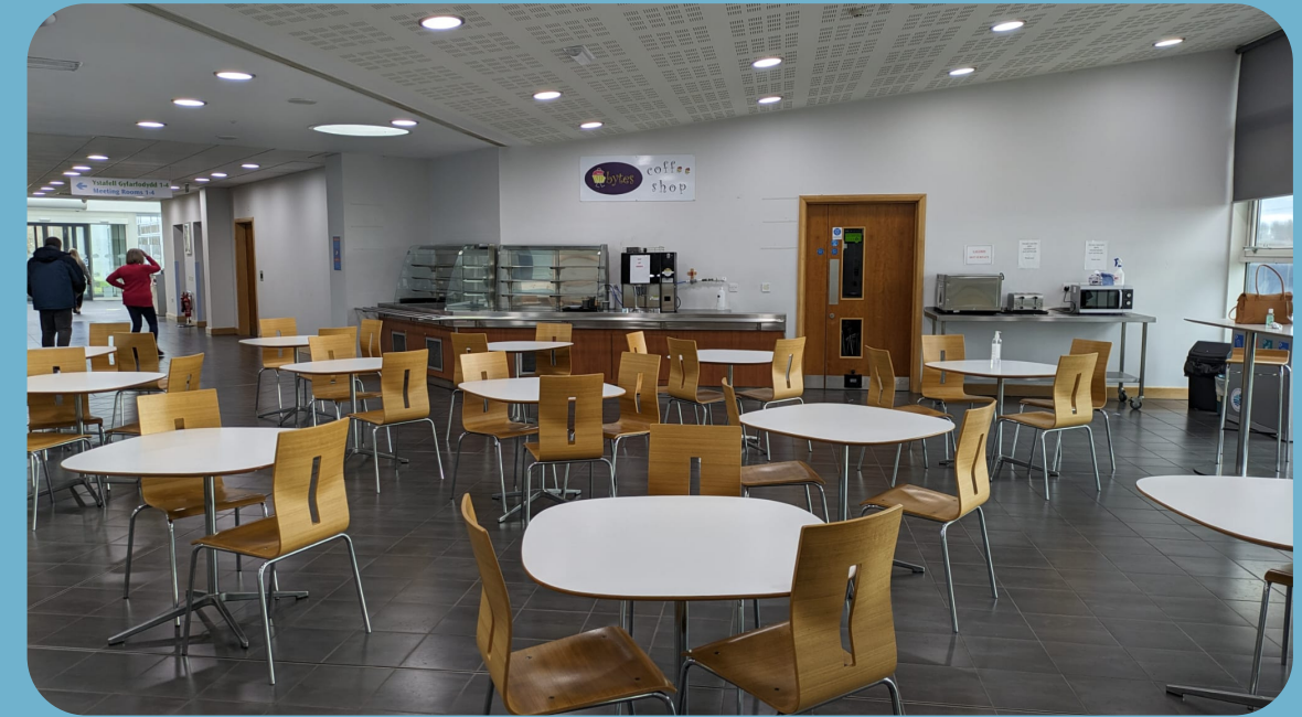
One Stop Coffee Shop

This leads directly to the reception where a member of staff can sign you in and notify the interviewer of your arrival.